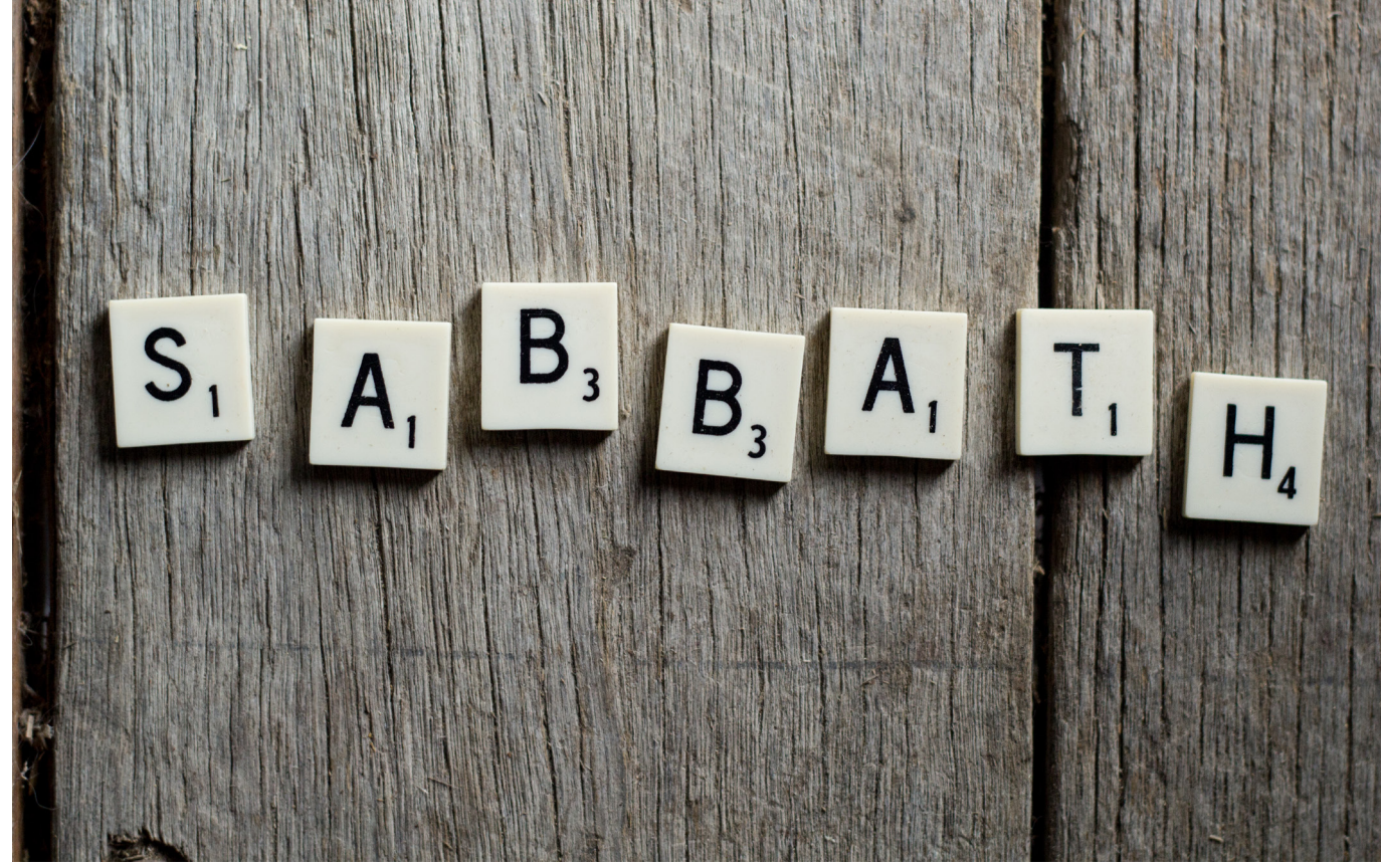
The day the Creator set aside

It is manifest in either the right hand or the forehead.