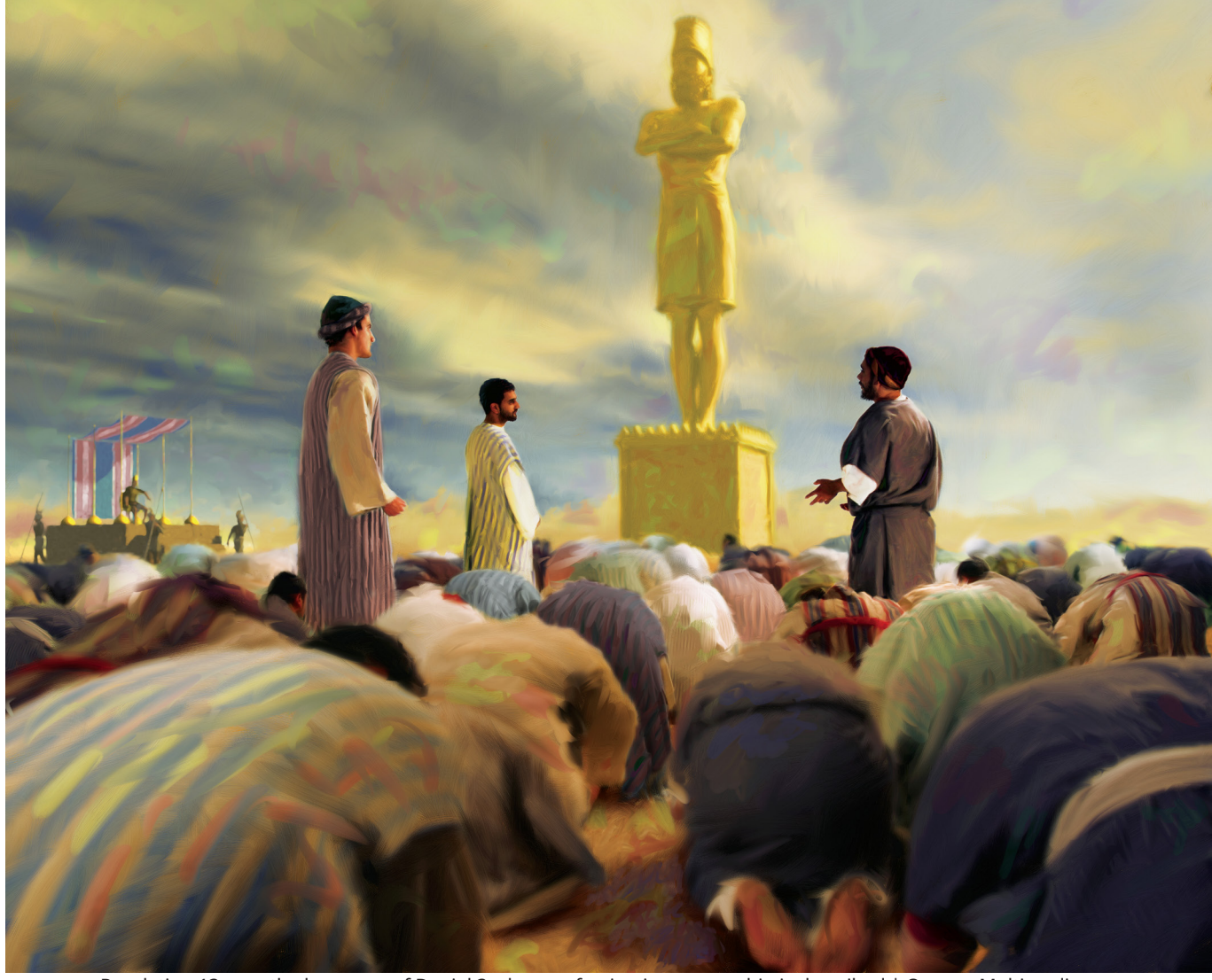
Revelation 13 uses the language of Daniel 3 where enforcing image worship is described | Oxygen Multimedia