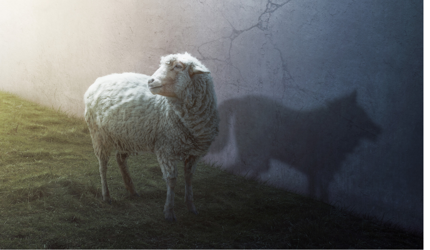
Jesus warned His followers that they would face deceptions from false prophets who would come to them in sheep's clothing (Matthew 7: 15)

Me has seen the Father" (John 14:9). And anyone who has seen the sea beast has seen the dragon!