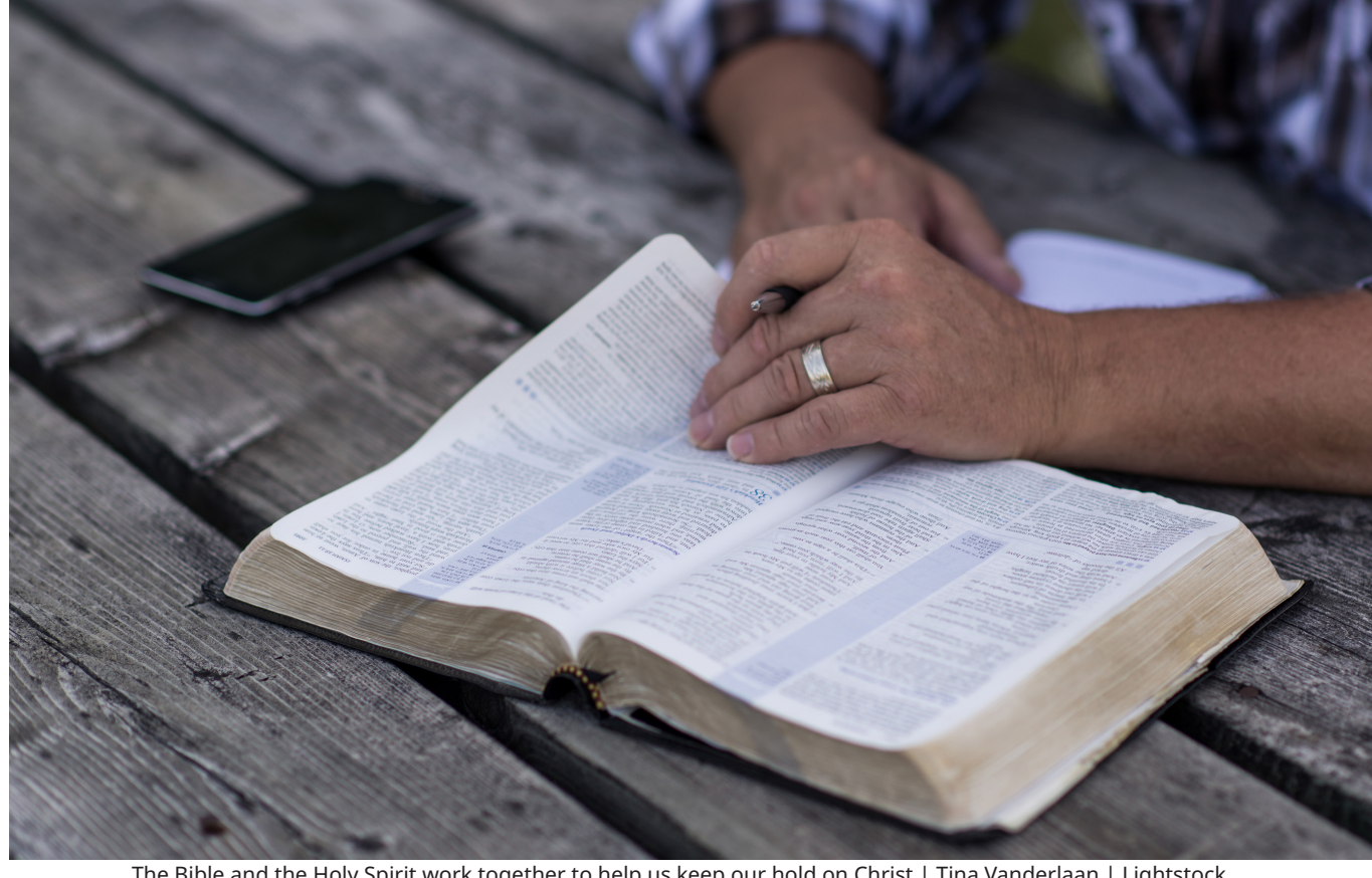
The Bible and the Holy Spirit work together to help us keep our hold on Christ